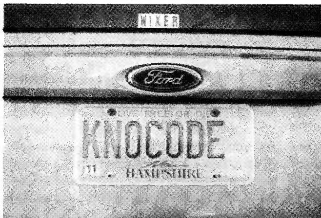
WIXER plate seen in New Hampshire!!