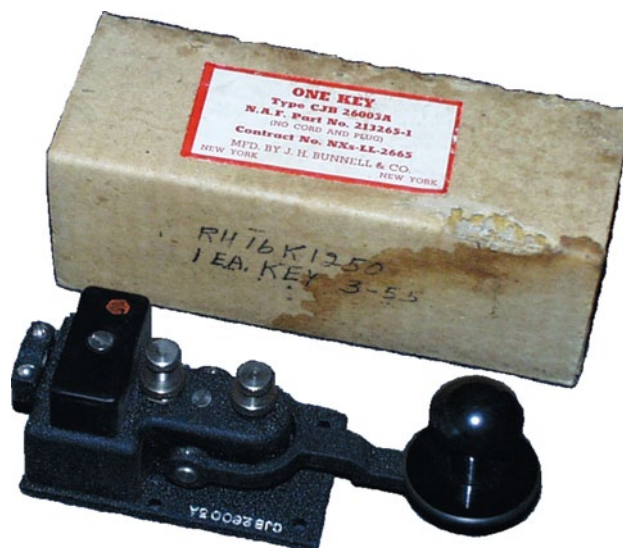
Navy Flame Proof Key Type CJG 26003A made by J. H. Bunnell & Co., March 1955 with the original box.