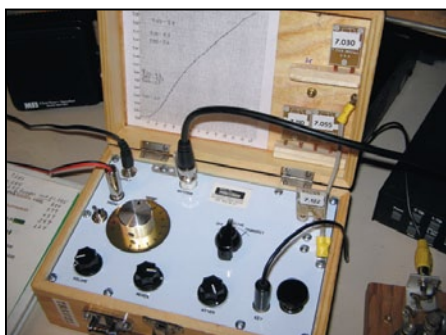
Bayou Jumper 40-Meter Transceiver Spy Radio Page 9