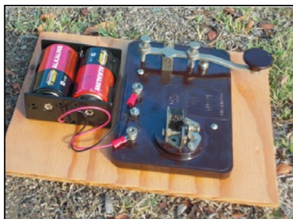
The Speed-X Model 45 Code Practice Oscillator, Page 8