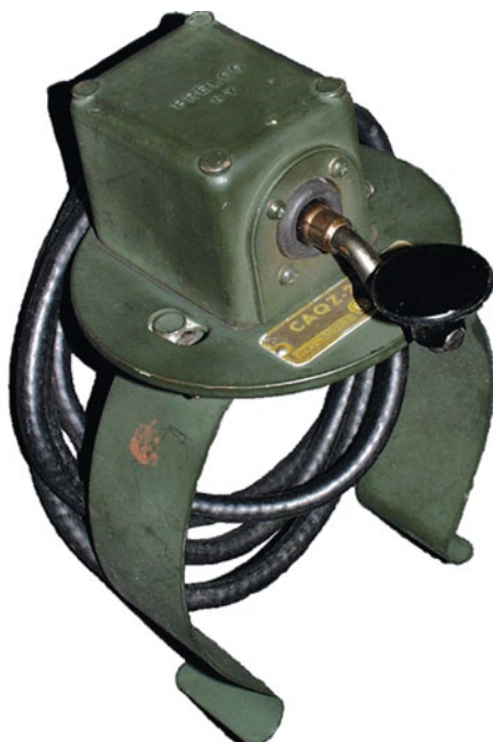
WWII Flameproof Leg Key CAQZ 26026 made by Brelco.