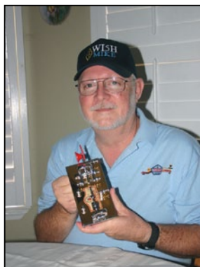
Americas Chapter Cumulatives Event Bug Key Winners! Page 8