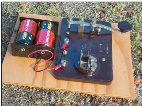
The Speed-X Model 450 Practice Oscillator.

After adjusting the buzzer's settings, I was able to make it sound a bit more pleasant to modern ears. The buzzer cover is missing and I haven't found a replacement. That cover might also reduce the volume and soften the tone.