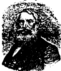
Samuel F. B. Morse 1791-1872

For news of what's happening in the world of Morse, read "MM"!