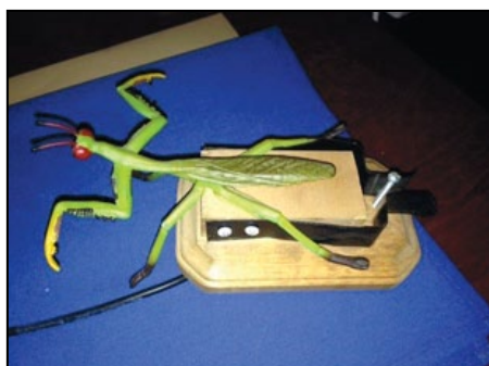
“Home- Brew Keys” Page 13