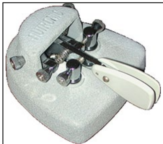
Autotronic Key built in 1960 by Electrophysics Corp. of Newport Beach, CA. From the collection of K6DF.