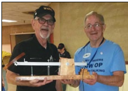
Photos from the 2016 Dayton Hamvention Page 17