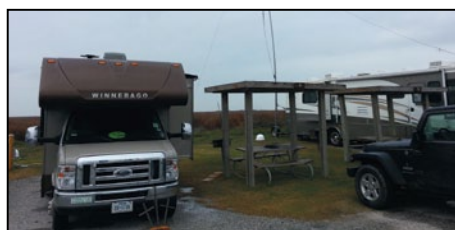
“CW Island Hopping” Page 14