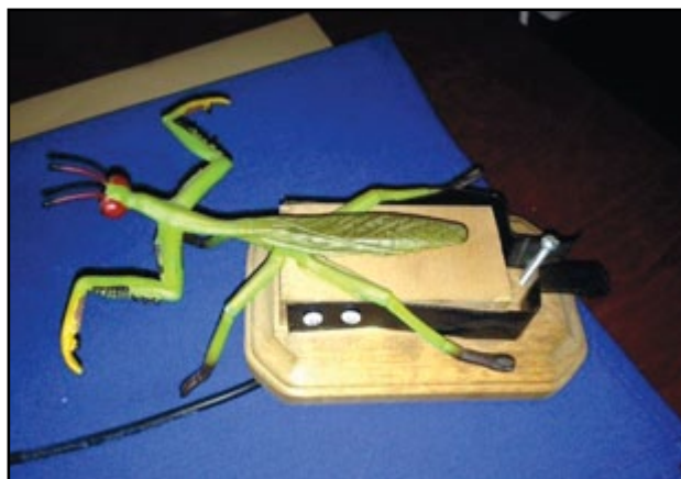
Figure 2: Finished bug